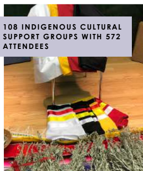
108 INDIGENOUS CULTURAL SUPPORT GROUPS WITH 572 ATTENDEES

The Prevention Test and Wellness team spent the last year emerging from COVID pandemic restrictions. Staff and community members came into the newly renovated Pit Stop area, groups and community education sessions re-emerged, one on one mental health and OT services moved to a client-centred hybrid model of service delivery, and cultural programming moved back into the Round Room and the Gathering Place.